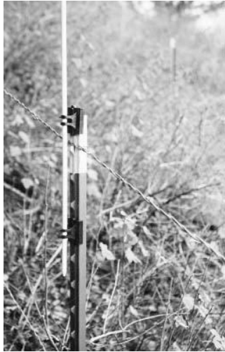
Figure 2. Using drilled out insulators, a T-post 4 feet high can be extended to 6 feet in height

The fiberglass rod costs about a dollar as compared to over three dollars for an 8-foot T-post. If you are using wood posts, drill a 3/8-inch hole in the top of the post. Insert the rebar or fiberglass rod in the hole to extend the height of the post.