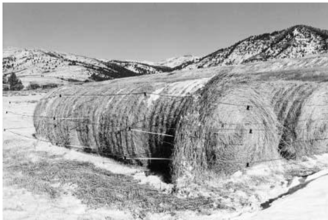
Figure 3. When the ground is frozen, rebar or fiberglass rods can be used to hold electric fence wires.

Elk and deer are notorious for eating out of haystacks, especially during extremely hard winters. Haystacks can be protected with electric fence even if the ground is frozen. Instead of using t-posts, steel rebar or fiberglass rods can be poked horizontally into the haystack to hold the wires in place (Figure 3). These rods are sturdy enough to hold the wires out away from the hay. Insulators can be attached to rebar so the wires do not ground out. Be sure to keep a 12 - 15 foot open border around the outside of the fence to make it easy for the animals to see the wire.