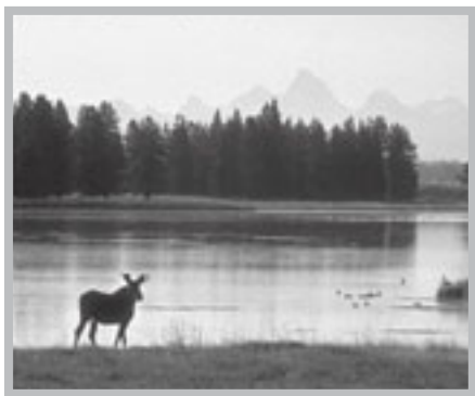
Harriman is a sanctuary for wildlife.

Youth Conservation Corps. After building one of the dormitories, the federal government reneged on any additional funds and thus the second dormitory was never completed. Increasing nightly accommodations is another opportunity for Harriman to respond to visitor demand and generate revenue, while maintaining the character of the park by utilizing existing structures. With no new development, Harriman could create a lodge in one of the two remaining barns. Park