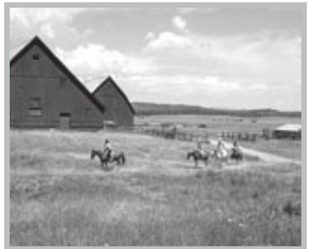
Horseback riding is a popular park activity.

One lesson to remember from past public land management experiences is that politics, not resource needs, determine appropriations. Examples abound in our national parks where Congress tosses money in the direction of the latest infrastructure crisis rather than providing for long-term maintenance. The sewer system is nearly beyond repair in Yellowstone National Park, but only after untreated wastewater spewed into Yellowstone's native trout streams was money appropriated for repair. And at Glacier National Park, the world renowned Going-to-the-Sun road is crumbling, while Congress earmarked $6 mil-