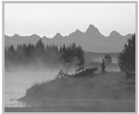
The Grand Tetons can be viewed from the park.