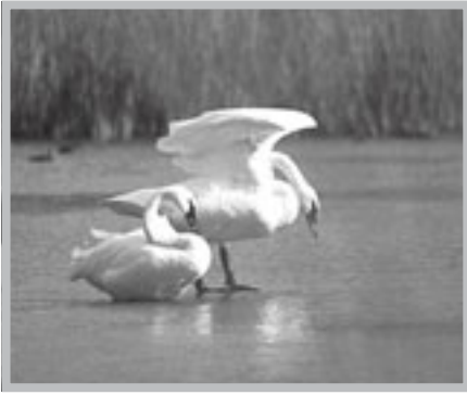
Rare trumpeter swans winter at Harriman.

Harriman shares much of the natural beauty of nearby Yellowstone and Grand Teton national parks, as well as some of the same problems of financial management that come from dependence on government appropriations. Set amidst a 16,000-acre wildlife refuge, Harriman shelters abundant wildlife, including the rare trumpeter swan, and offer's world class fishing on the Henry's Fork of the Snake River.