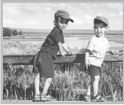
Families enjoy a day in the park.

charges an entry fee of $2.50 per person, rather than the typical per vehicle fee. Per person fees are more reflective of the costs of park use. New Hampshire was the first state park system to implement differential pricing for campsites, reflecting the different levels of amenities offered and different levels of demand for them. It also has an extensive donor program and a growing system of partnerships with companies (Leal and Fretwell 1997a, 12).